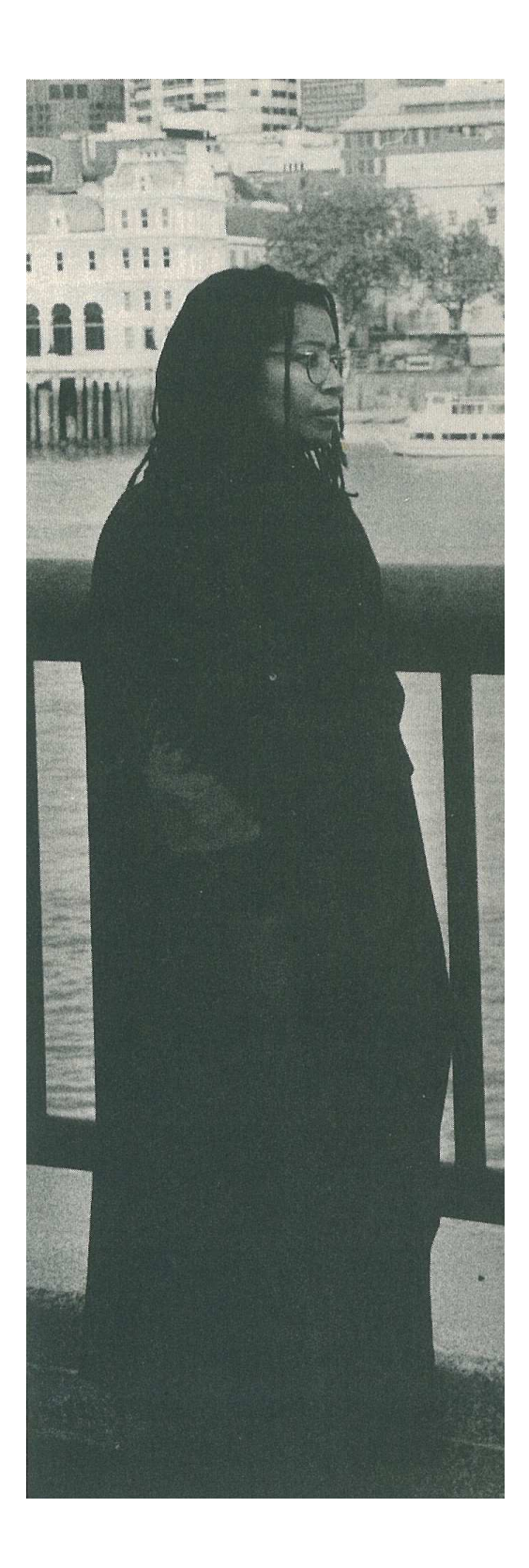
In: WALKER, Alice, PARMAR, Pratibha. Warrior Marks- Female Genital Mutilation and The Sexual Bliding of Women. San Diego: A Harvest Book, 1993, p. 120.