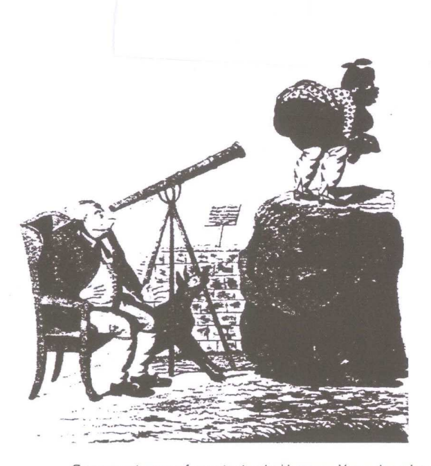
German caricature of man viewing the Hottentot Venus through a telescope, early nineteenth century.

In: GILMAN, Sander L. "Black Bodies: Toward an Iconography of Female Sexuality in Late Nineteenth- Century Art, Medicine, and Literature", 1985, p.239.